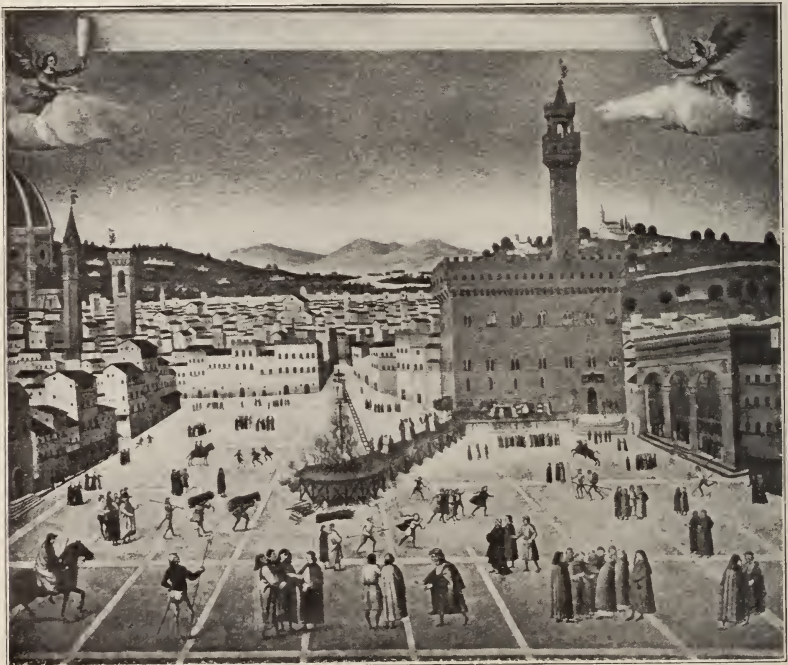
THE EXECUTION OF SAVONAROLA. From an old painting in the Museum of San Marco.

The 23d of May, 1498, arrived, and the brave monk was dragged to the place where but a brief while ago the bonfire of vanities had been lighted, and there with shameful indignities, he and his fellow martyrs were degraded, denuded of the robes of their order, and delivered into the hands of the executioner. He ascended the fatal pile. Two papal commissioners had assembled with parade and pomp to direct the final arrangements. The white frock of the Dominican was first removed. Holding it in his hand Savonarola exclaimed, "Holy robe, how much I longed to wear thee. Thou wast given to me by the grace of God, and to this day I have kept thee spotless." The Bishop of Verona then pronounced the terms of degradation. "I separate thee from the Church militant and the Church triumphant," to which the pale monk replied in calm tones, but tones that pierced through all the surging crowd, "Militant—not triumphant—that is not thine." And then